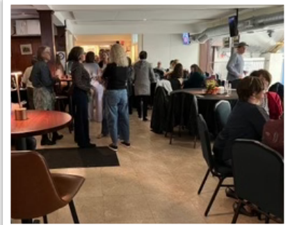
And even better company!

It's On! Team Toomsalu is again coordinating the WW's fifth Annual Selfies Challenge. Grab this team building opportunity to have fun and be creative together AND DON'T FORGET - send in those selfies! Prizes and bragging rights are on the line.