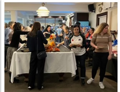
Great food at the Wine and Cheese